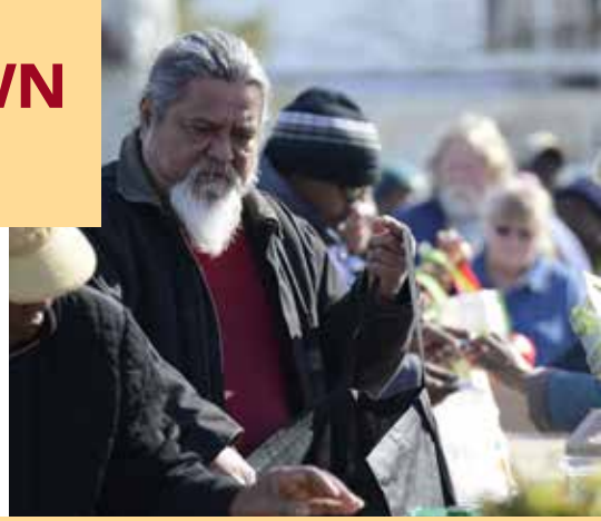
PICTURED: A gentlman recieving food at one of our many Hope ile Sites that is powered by the Emergency Food Fund