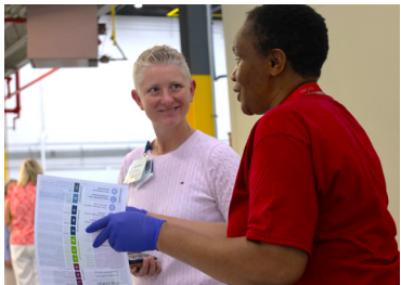
Guests learning more about the Center for Health, Wellness & Nutrition