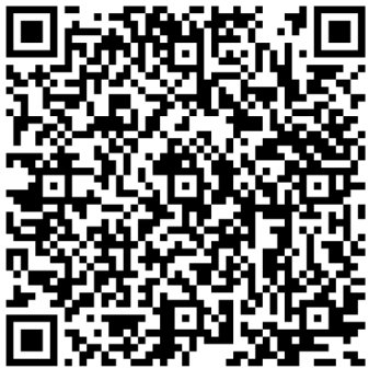
Please scan here to submit your recipe