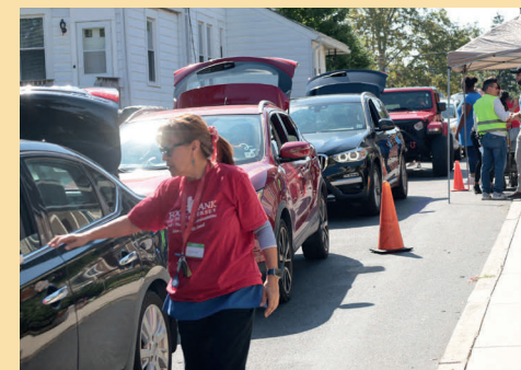
Grace Episcopal Church