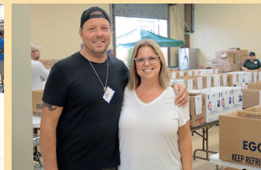
Calvary Chapel Gloucester County