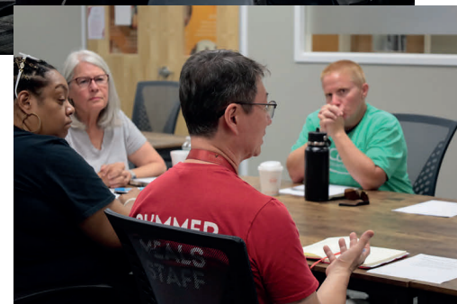
FBSJ Agency Council Meeting