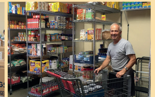
First Baptist Church of Moorestown