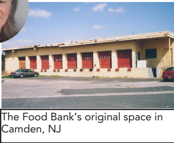
The Food Bank's original space in Camden, NJ