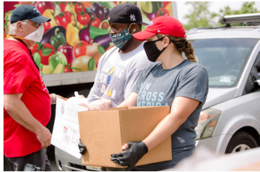
Mobile distribution during the pandemic, and a rendering of our new space at 1300 John Tipton Blvd. Redering my differ from final construction.

We also learned that the Local Food Purchase Assistance Cooperative Agreement Program – which provides neighbors with fresh produce from local farms – will end later this year. That means a loss of 284,000 pounds of food for FBSJ and carries serious implications for local farmers and their businesses, who have relied on this partnership to sustain and grow their operations.