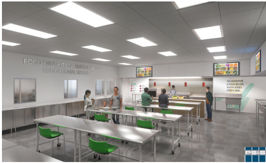
Rendering of proposed kitchen. May be different from final construction.

With dedicated areas for nutrition education, cooking demonstrations, volunteer activities, and more, this center will bring together partners, neighbors, and families in a shared commitment to well-being. By investing in this space, we're strengthening our roots and expanding our reach.