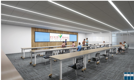
Rendering of proposed training center. May be different from final construction.

From increasing access to culturally relevant foods to reaching more older adults and children with tailored services, our goal is simple: make it easier for every neighbor to get the nutritious food they need. With your help, we're expanding capacity, improving infrastructure, and closing critical gaps in service.